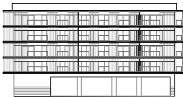
Edifici 2 - Alçat C