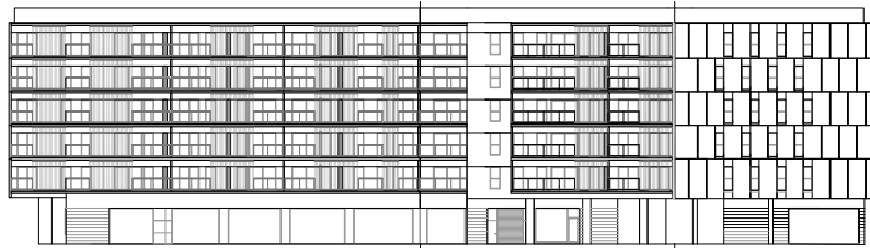
Edifici 1 - Alçat A